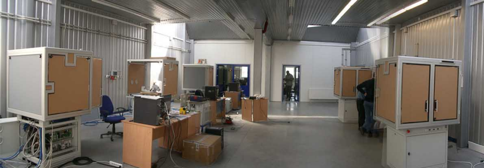
View of the Oxford Diffraction final assembly area

"We have designed this product to suit the needs of the modern research group. The Total Care package furnishes our customers with the peace of mind to concentrate on their scientific research while we look after the instrument"